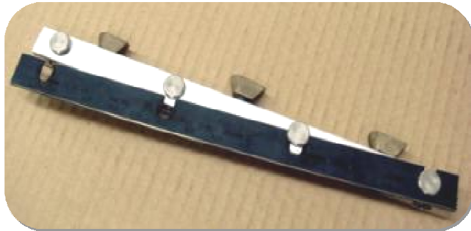
The Variable Rotary Cutter Uses Cost Efficient Disposable Straight Knife