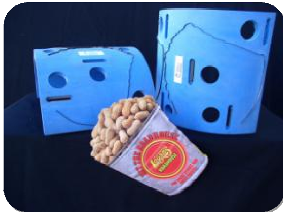
The Rotary Cutter Can Also Be Used To Produce Wide Variety Of Straight & Contour Cut Products With Full Bleed Trimming