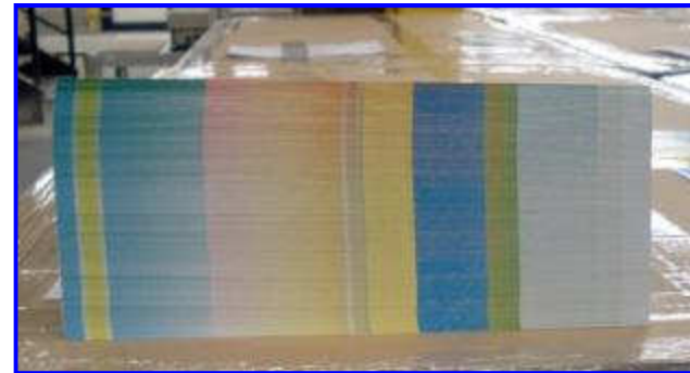
Straight Cut Products