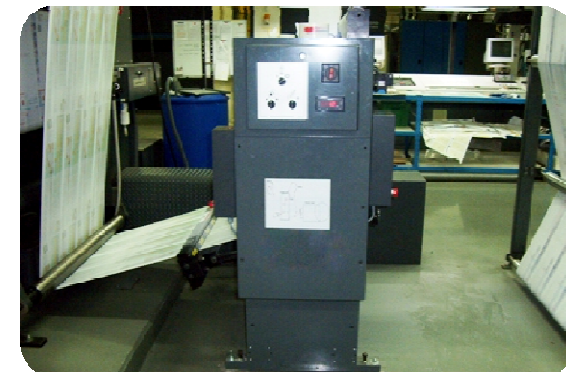
Example of Installation of Pattern Perforator