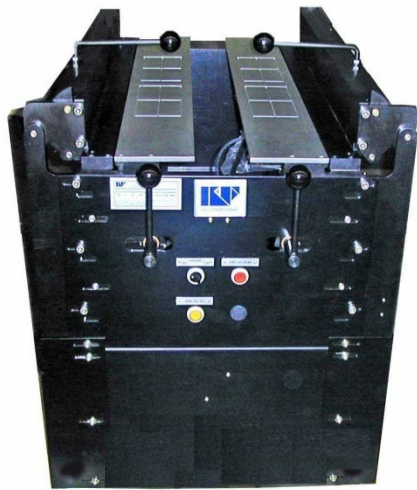
Optional – Universal Semi-Automatic Plate Bender