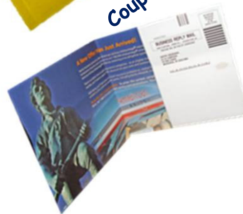
Business Reply Cards