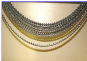
Perforator Litho Strips